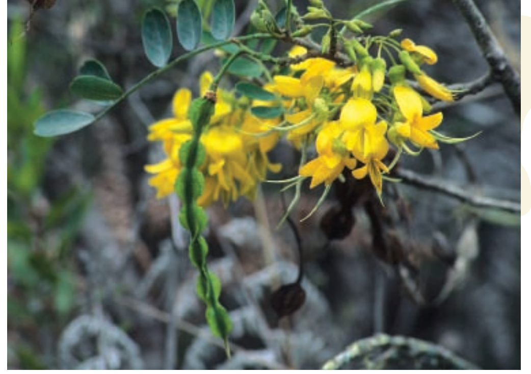
The palila requires māmane (a native legume) to survive. Māmane provides food and nesting, breeding, and foraging habitat.

Under the federal Endangered Species Act, the U.S. Fish and Wildlife Service listed the palila as endangered in 1967 and designated critical habitat for the bird in 1977. The critical habitat roughly follows the boundaries of the Mauna Kea Forest Reserve, which is under the jurisdiction of the Hawai'i Department of Land and Natural Resources (DLNR) Division of Forestry and Wildlife (DOFAW).